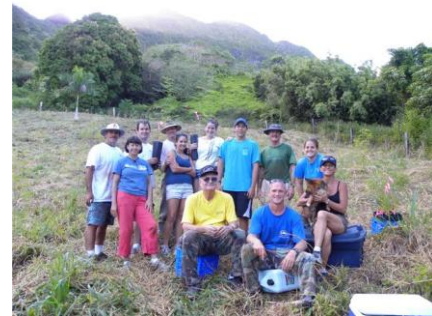
Kualoa Ranch site outplanted in the Koolau.