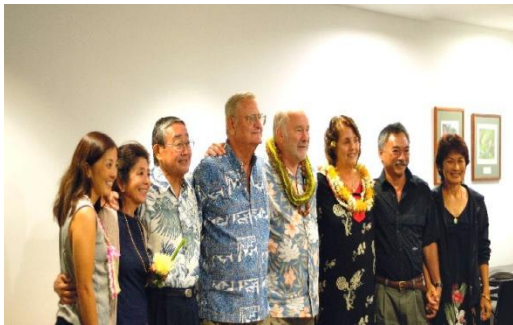
Iliahi Foundation founding board members are retiring.