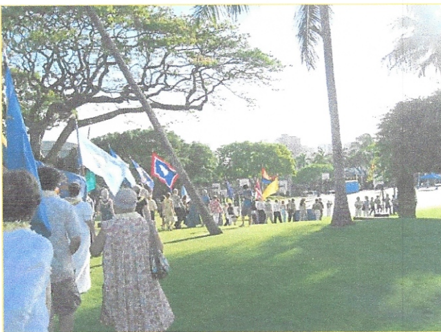
The 50 th Parade to the Luau