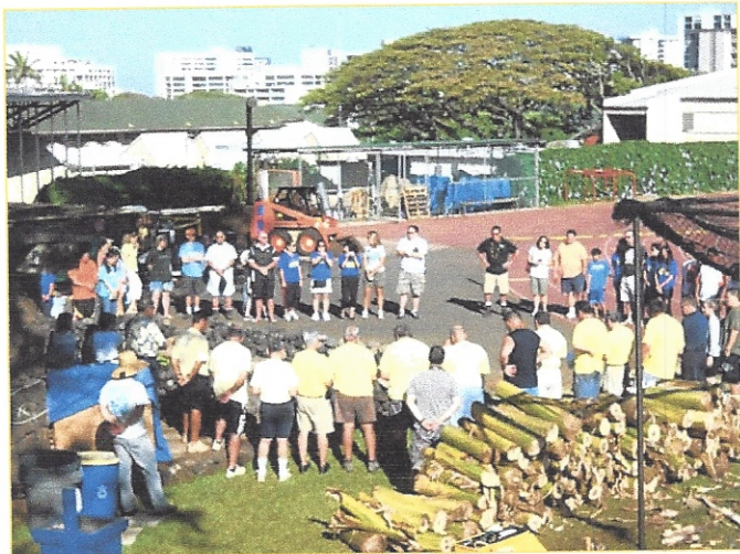
Prayer service at the Imu Pit