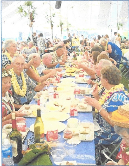
Our 50 th Luau