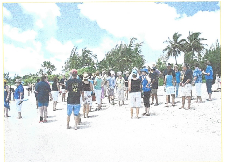
Gathering for Ceremony