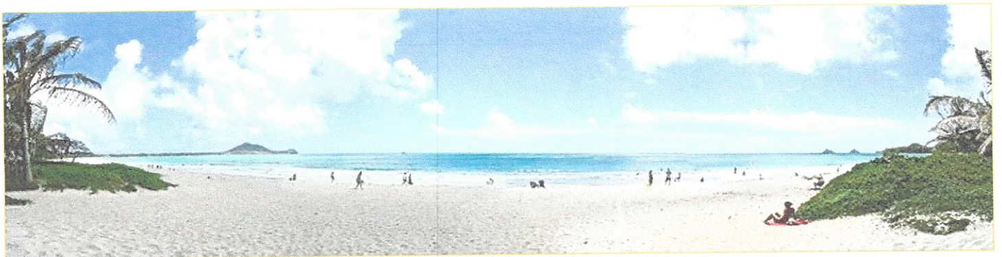
Sunday at Kapalama Beach Club, Kailua Oahu