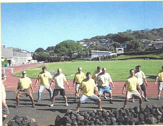
The Imu Pit gang performs the Kane Make Hula