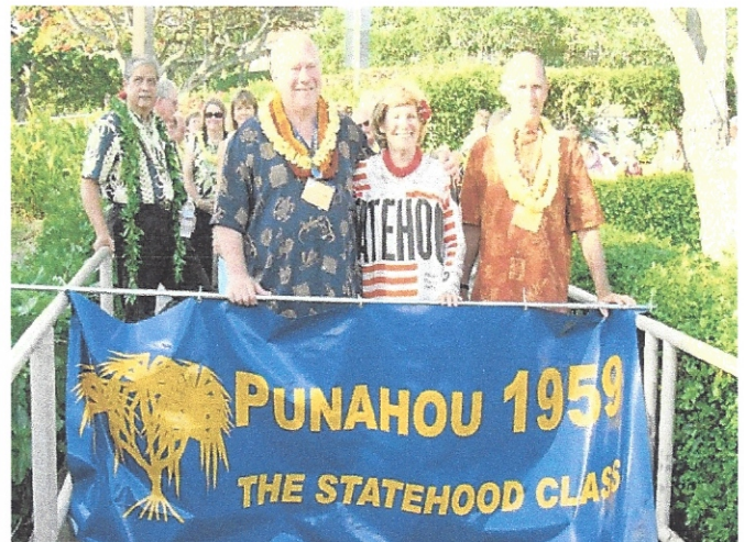
The Luau parade begins