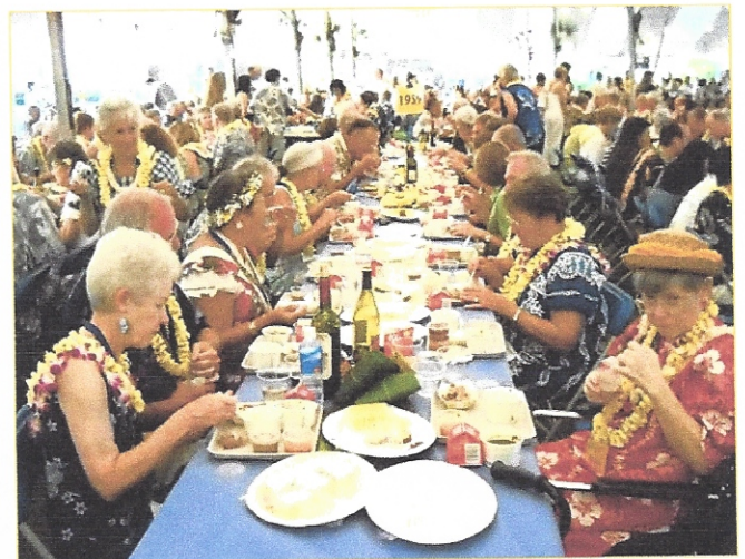
The Luau food this year was Onolicious

Punahou Class of 1959 - 50 th Reunion June, 2009