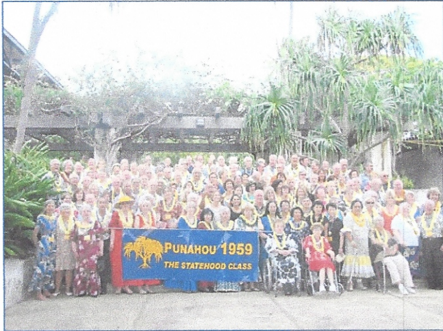
Official Class photo