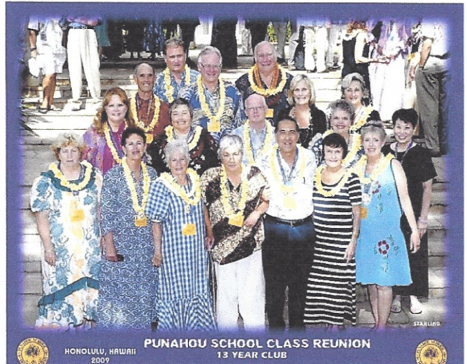
HONOLULU, HAWAII 2009 PUNAHOU SCHOOL CLASS REUNION 13 YEAR CLUB