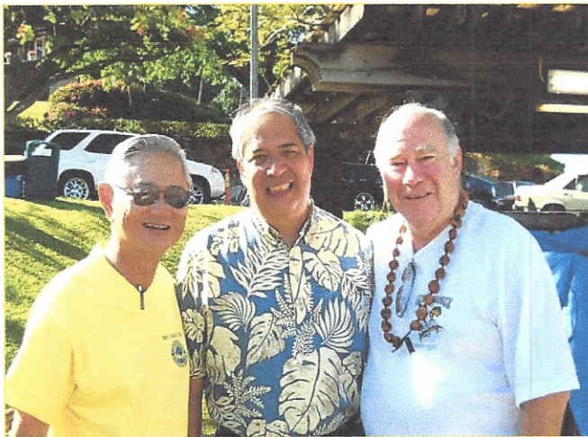
Punahou's Sons of Hawaii: Asia, Polynesia and Europe