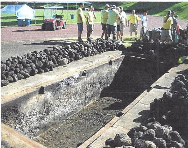
Imu Pit preparations for the kalua Pua'a