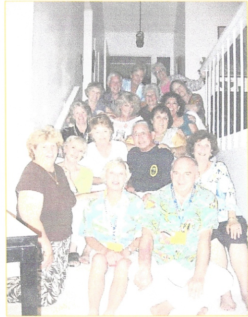
The Thursday Dinner Cruise gang poses on the stairs