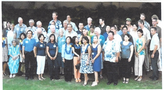
Class gift presentations