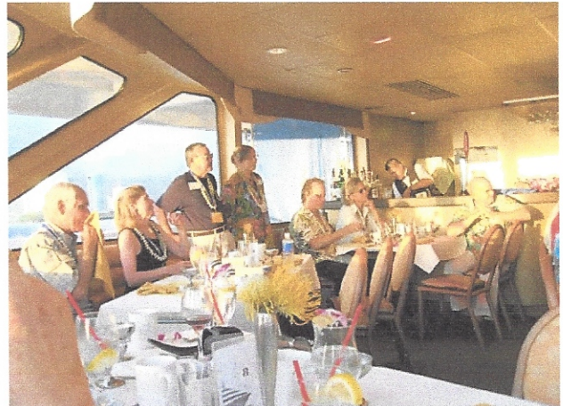
Evening dinner cruise off Waikiki on Thursday