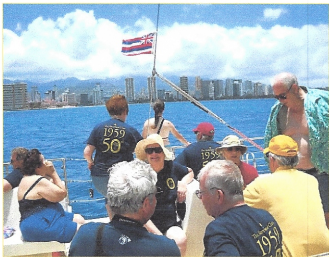
Catamaran ride off Waikiki