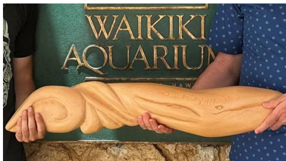
800+ year old Yellow Cedar Kohola

Youth of Monterey California carving the 9/11 One Voice Healing Pole in 2001 that was gifted to New York City in 2002.