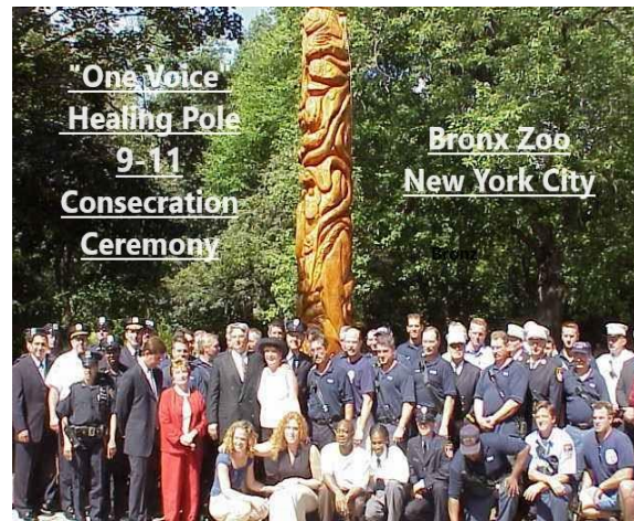
The 9/11 One Voice Healing Pole installed at the Bronx Zoo in 2002