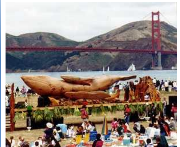
Mother Kohola and Keiki greeting the Hokule'a in San Francisco in 1995