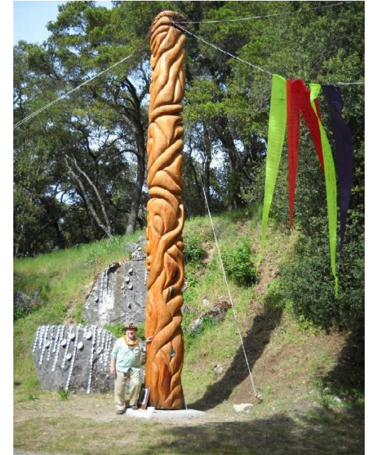
The First Peoples of California Healing Totem - Indian Canyon

One of the 30 crystal vessels holding blended waters gathered from 30 sacred places around the world for the United Nations 50th Anniversary Interfaith Service in San Francisco in June of 1995.